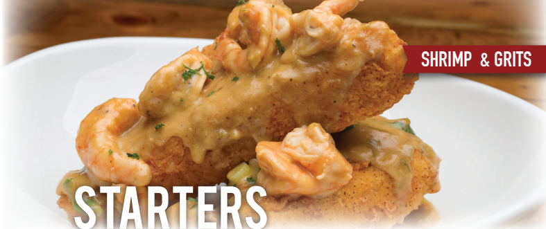
SHRIMP & GRITS