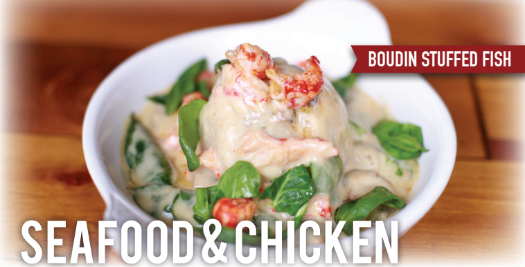
BOUDIN STUFFED FISH

Poboy French baguettes topped with lettuce, tomato, pickles, and mayo. Choice of shrimp, chicken or fish Serves 6-8: $54