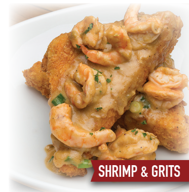
SHRIMP & GRITS