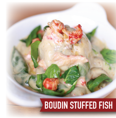
BOUDIN STUFFED FISH